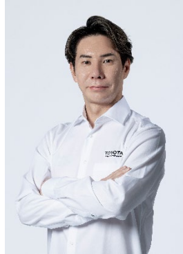
Kamui Kobayashi Team Principal